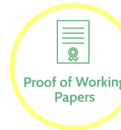
Proof of Working Papers

*No additional documents needed if you provided US passport