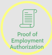
Proof of Employment Authorization

*Must have date within 6 months of enrollment *Must include the participant and/or parent/guardian name and address