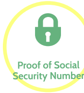
Proof of Social Security Number

*If providing Valid U.S. passport, it must be signed by participant