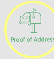
Proof of Address