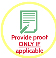
Provide proof ONLY IF applicable