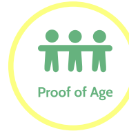
Proof of Age

*Must have photo of participant *If dated, must be valid at the date of enrollment