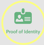
Proof of Identity